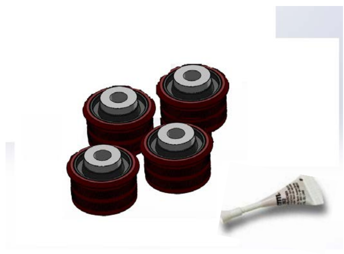
Rear Control Arm Lower Sealed Monoball Kit

Our fully sealed monoball cartridge kits feature maintenance free PTFE linings requiring no supplemental lubrication. We've designed in weather seals to keep dirt out and extend product life. This is the only monoball suitable for street or extended track use. Dirt and water contaminate ordinary products and accelerate wear.